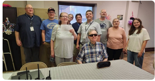
Ham Radio participants with volunteer instructors from the University of Scranton